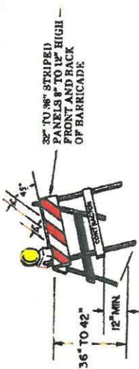
TYPE I BARRICADE

THIS EXAMPLE IS FOR A TYPICAL BLOCK CONFIGURATION IF YOUR STREET DOES NOT MEET THIS CONFIGURATION, YOU MAY BE REQUIRED TO SUBMIT A TRAFFIC CONTROL PLAN WITH YOUR APPLICATION.