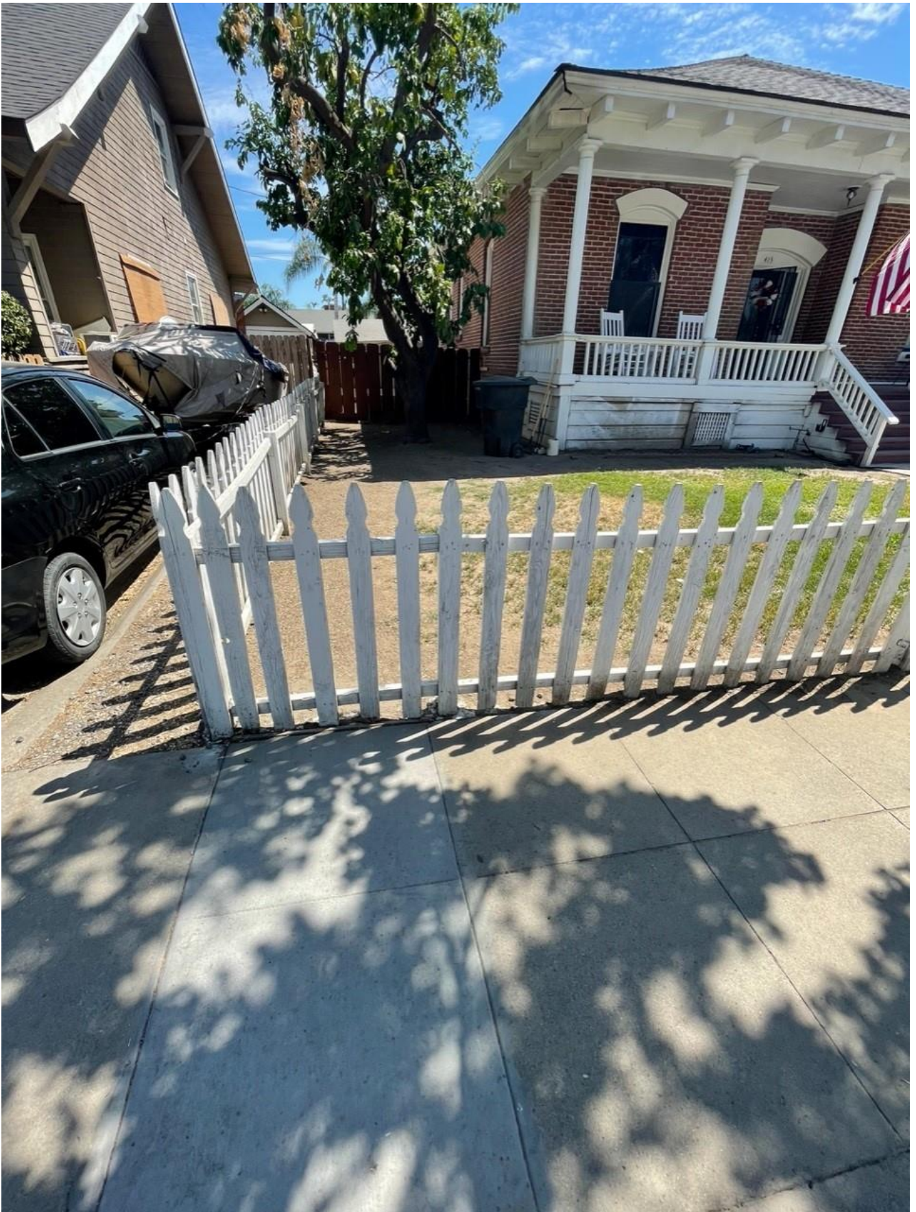
Northwestern corner fence.