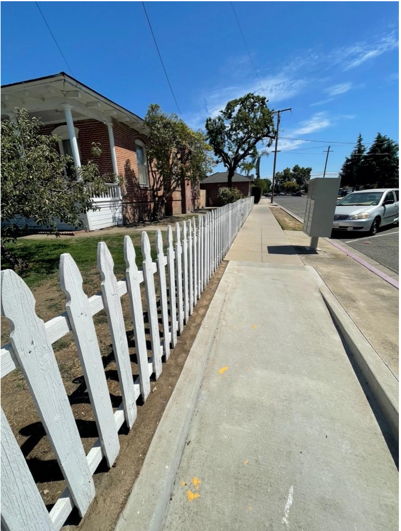
Western boundary fence.