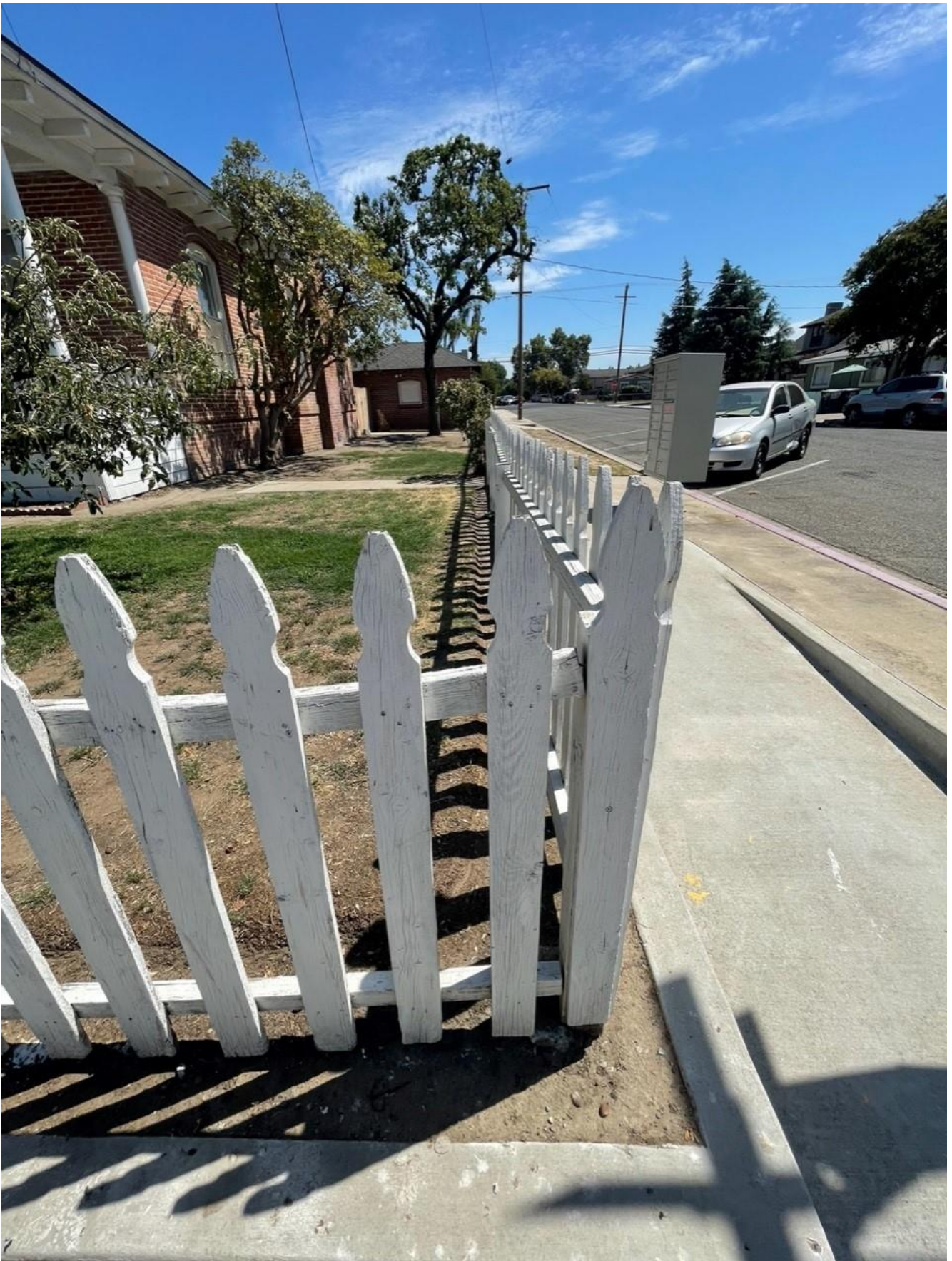
Northwestern corner fence.