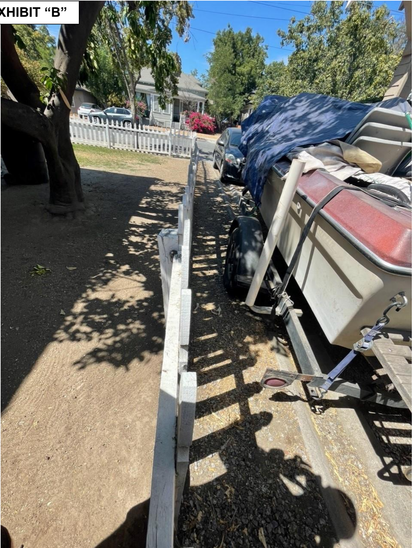
Eastern boundary fence.