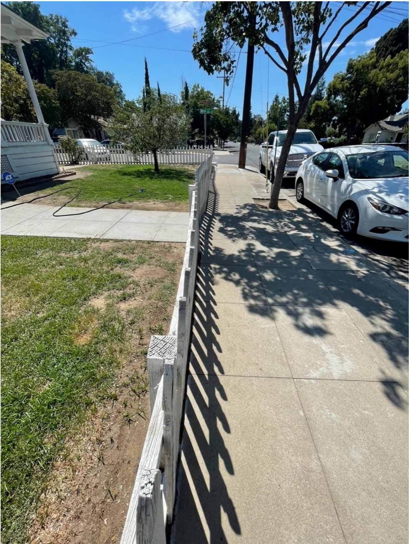
Northern boundary fence.