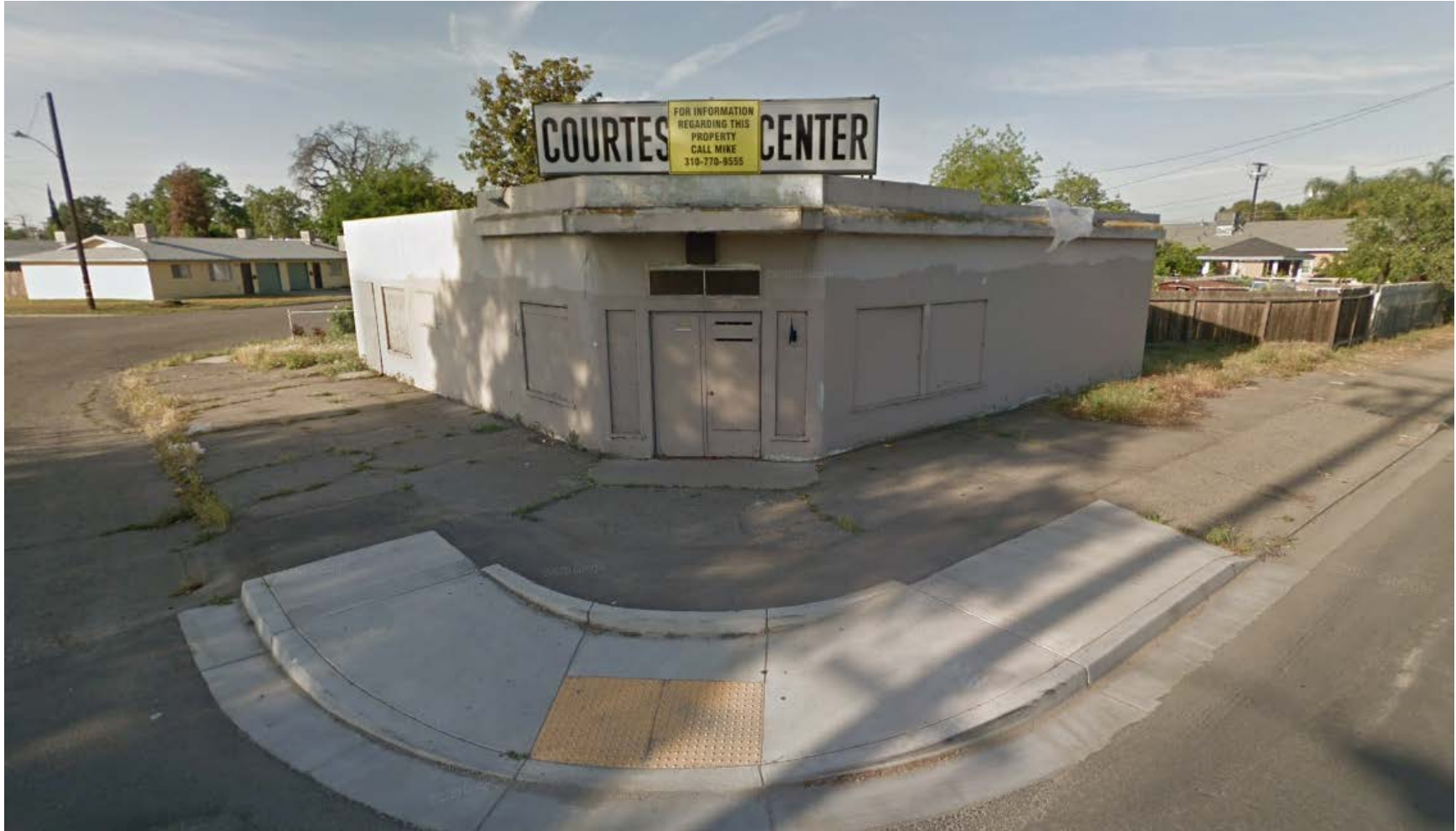
Southwest corner of Houston Avenue and Northeast 5 th Avenue / Church Street