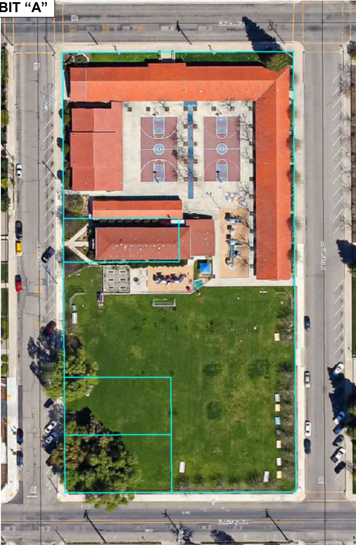
HPAC Item No. 2020-10 – Reroof