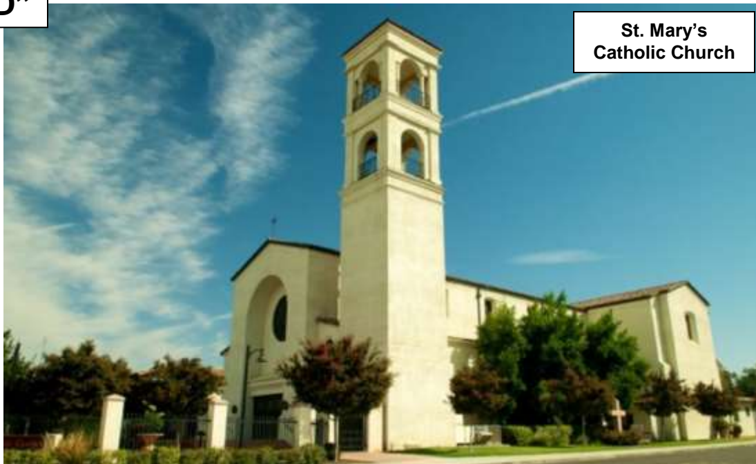
St. Mary's Catholic Church