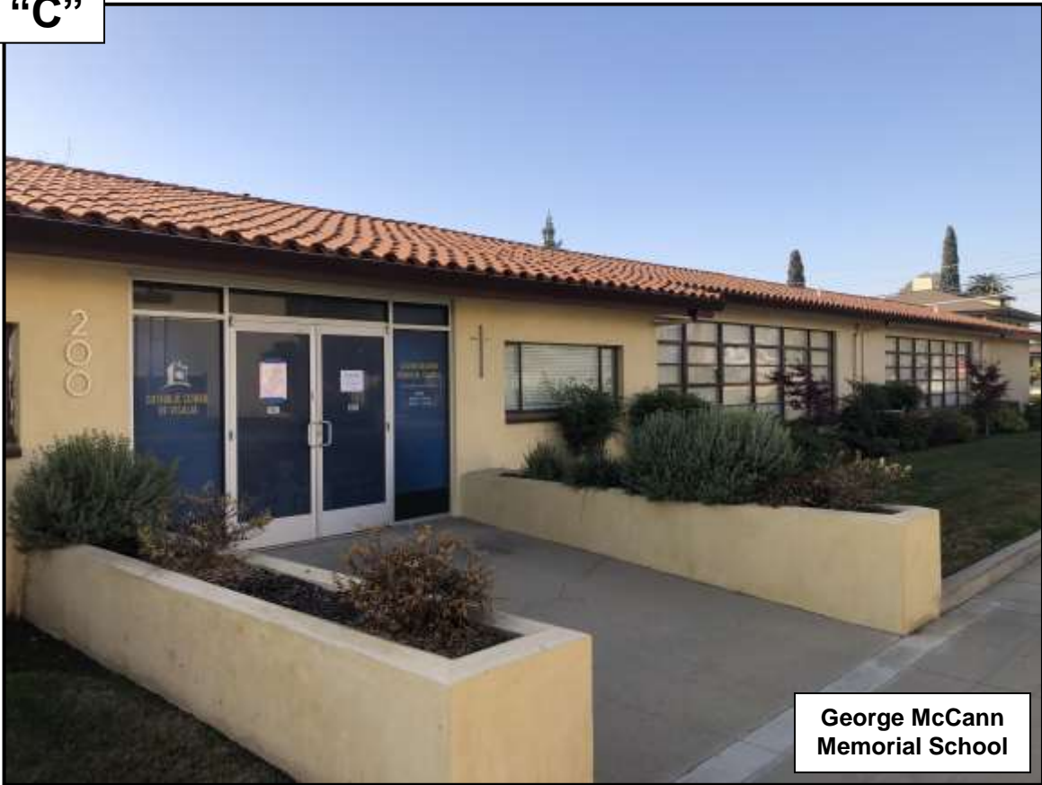
George McCann Memorial School