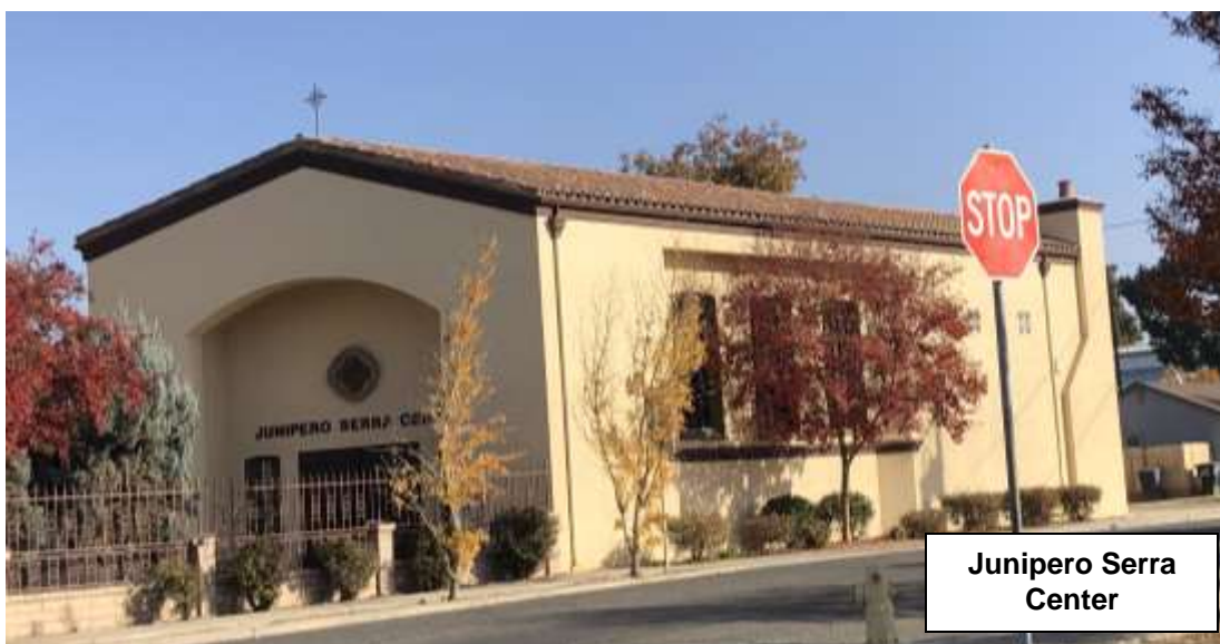
Junipero Serra Center