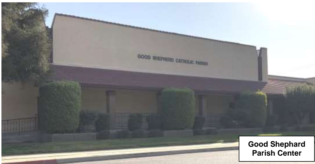
Good Shephard Parish Center