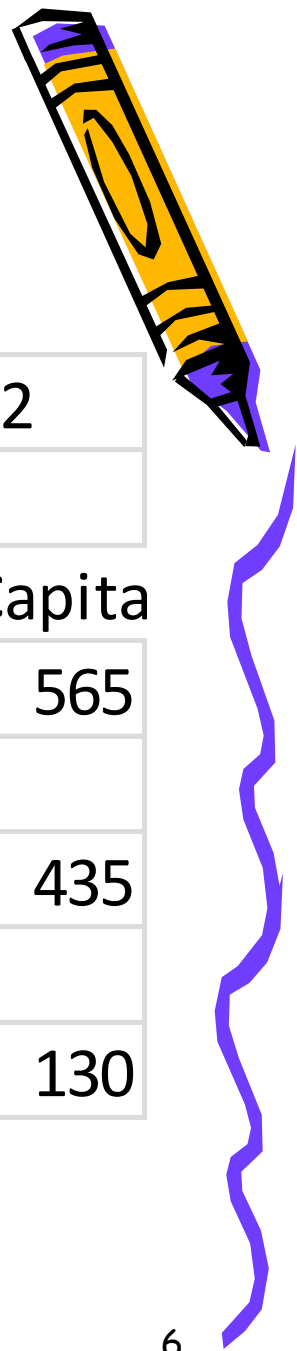
Average General Fund Spending Per Captia FY 2011/12