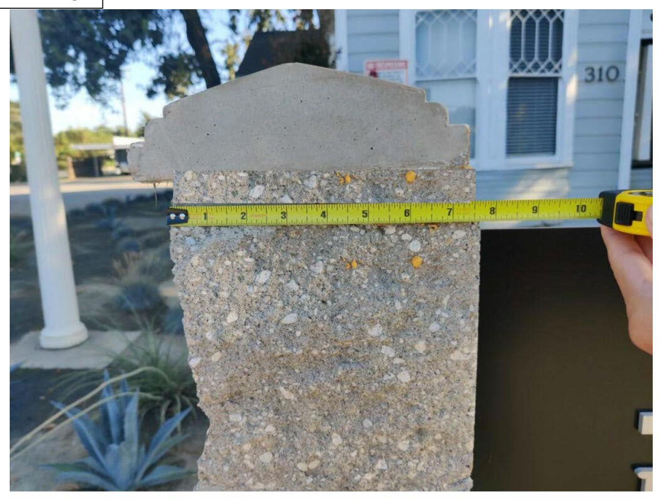
Pyramid in Style (Front View)